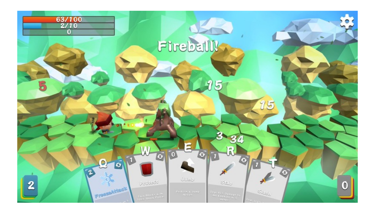
Download ->>->> http://bit.lv/2JZ5gCl

Circle Empires: Apex Monsters! Download Windows 10 Free